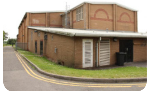
Rainwater harvesting equipment proposed on roof

Bradley Stoke Leisure Centre has a catchment of over 360,000 adults within a six mile radius. The leisure facilities include two swimming pools, a 6 court sports hall and an 80 station gym. The centre is major hub for the local community housing the library amongst other amenities.