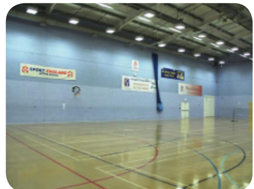
Booking management system control to sports hall