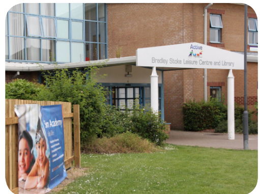
Main entrance to centre

Rainwater harvesting equipment is to be added to the roof of the swimming pool and sports centre. External storage tanks will hold the water until it is required and transferred into the building via a new pumping system. The water will be used to flush toilets and urinals, thereby reducing the overall demand for clean water. It is anticipated that a reduction of 25% in mains water usage is feasible with this installation and could save the centre up to £210,000 per annum. The centre has estimated that it could harvest up to 70% of the 100,000 m 3 water it uses each year.